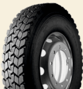
INSA TURBO TDY SM -TYPE B