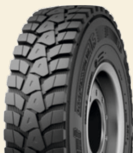
CORDIANT DM-1 PROFESSIONAL