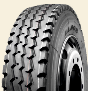
INFINITY - LEAO LLA08