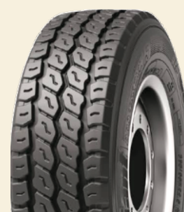
CORDIANT TM-1 PROFESSIONAL