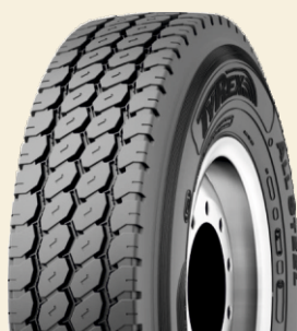
CORDIANT VM-1 ALL STEEL