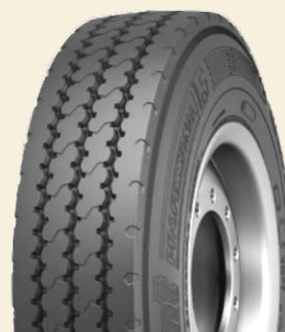
CORDIANT VM-1 PROFESSIONAL