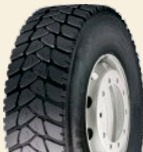
INSA TURBO TDO-3-TYPE B