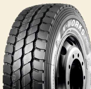
INFINITY - LEAO KXA400