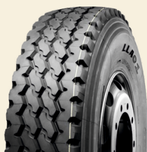
INFINITY - LEAO LLA01