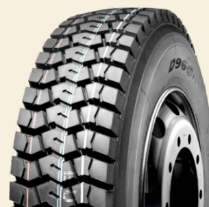
INFINITY - LEAO D960