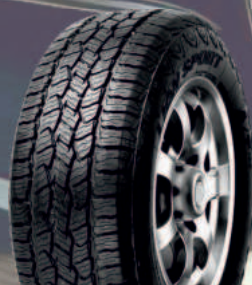
LION SPORT AT 100