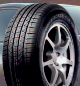
NOVA FORCE HP 4X4