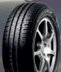
NOVA FORCE VAN HP