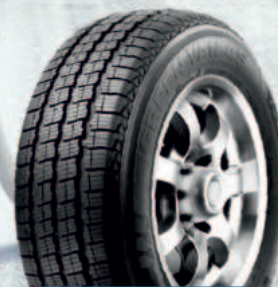
I-GREEN VAN ALL SEASON