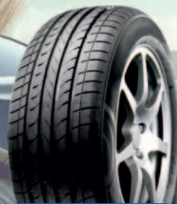
NOVA FORCE HP 100