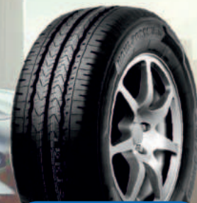
NOVA FORCE VAN