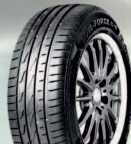
NOVA FORCE CS