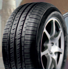
NOVA FORCE GP