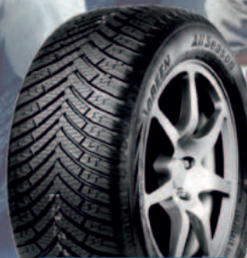
I-GREEN ALL SEASON