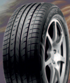
NOVA FORCE HP