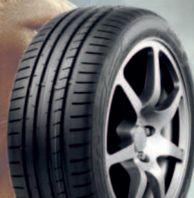
NOVA FORCE ACRO